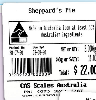
LS-5860BK Format ID51 (PLU Item)

3. LS-5860BK Labels = Blank, CoOL label. Format ID51 = PLU Item label. This label prints CoOL Info, PLU Name, Packed Date, Use By Date, EAN 13 Barcode, Net kg or Pieces (PCS), Unit Price ($/kg), Total Price, and Company Details.