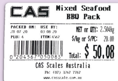
LS-5840BK Format ID72

Note: If this label is missing the Large $ sign in total price, please contact the dealer or CAS.