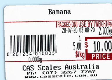
LS-5840R or LS-5840B Format ID10