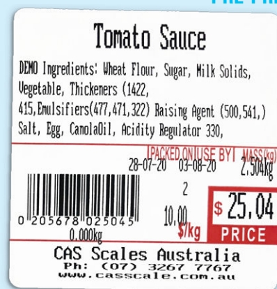
LS-5860R or LS-5860B Format ID23

1. LS-5860R Labels = Pre-Printed ( Colour Red ), Factory label. Format ID23. This label prints PLU Name, Packed Date, Use By Date, EAN 13 Barcode, Net kg or Pieces (PCS), PLU Number, Unit Price ($/kg), Total Price, Tare Weight and Company Details.