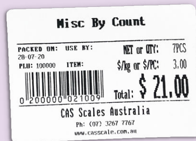
LS-5840BK Format ID71