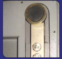
Adjustable & Swivel Feet